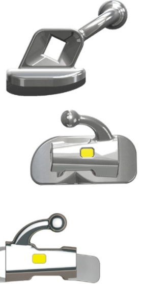
ORIONLP on welding flange

One of the most appealing features of the ORIONLP is its trumpeted entrance to facilitate easy wire insertion.